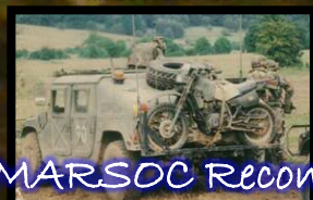
MARSOC Recon "Wolfpack-4"